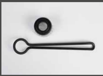
Material saving of 50 %