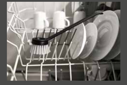
Washable in the dishwasher for longer hygienic durability