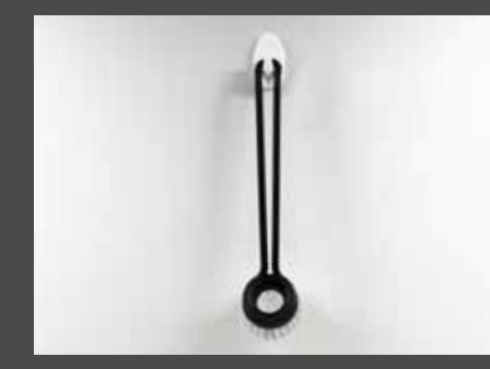
Practical to hang up