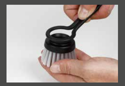
Easy changing of the heads