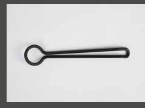
Stable and lightweight